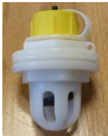
Item no. 45-042