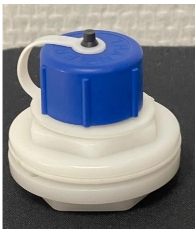
Item no. 45-029