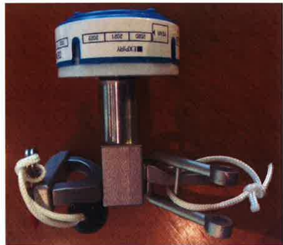
DK2011 30 months service life