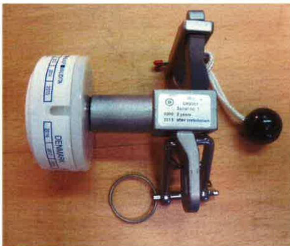
DK2011 4 years service life